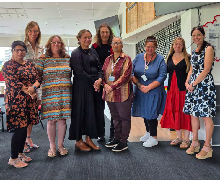
Member haerenga to Tāmaki Makaurau in March 2025.