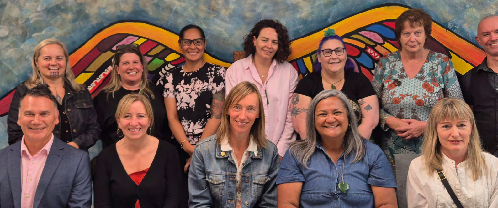
Member haerenga to Tāmaki Makaurau in March 2025.