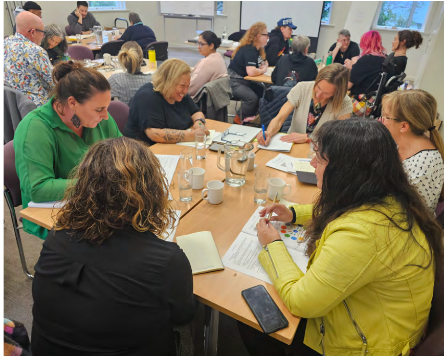
Attendees at the inaugural TQ (Tiriti/Treaty Literacy) in Organisational and Workforce Development in Te Whanganui-a-Tara, May 2025.

We launched two new programmes during the reporting period that have a strong alignment with the vision, mission and values of Te Pai Ora SSPA: 'Being a Good Tiriti Partner: a Pākehā Perspective' and 'Creating TQ (Tiriti/Treaty Literacy) in Organisational and Workforce Development.' These interactive workshops build participants' knowledge of Te Tiriti o Waitangi and encourage bringing this understanding into their everyday mahi.